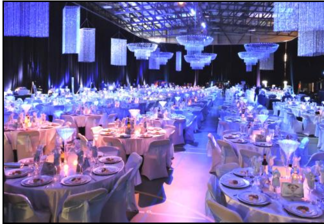
AECOM Field House - Banquet Set-up